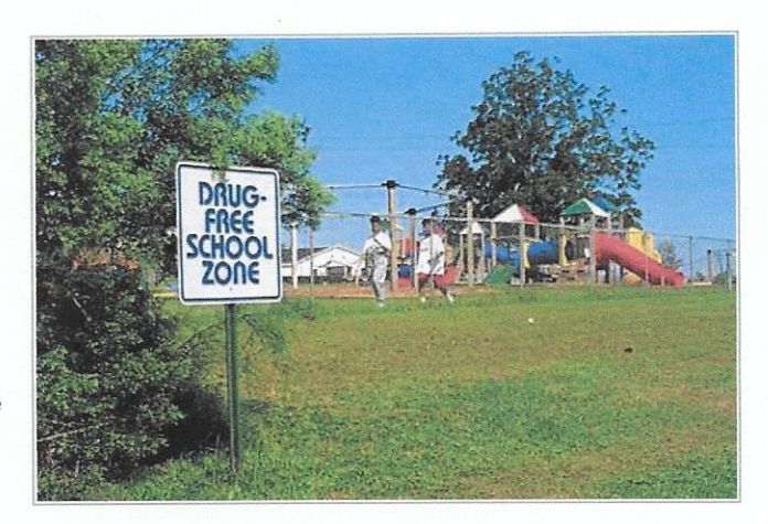
Following the crack epidemic of the 1980s, laws created drug-free school zones, such as this one

Citing such developments, the Washington-based Justice Policy Institute is issuing a report Thursday that contends such laws, which generally carry extra-stiff mandatory penalties, have done little to safeguard young people and are enforced disproportionately on blacks and Hispanics.